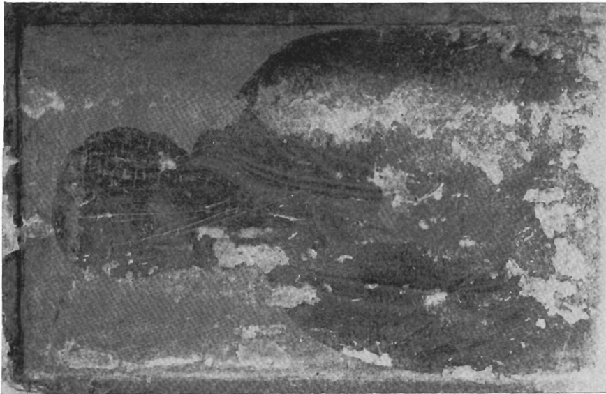
A. — St. Paul.