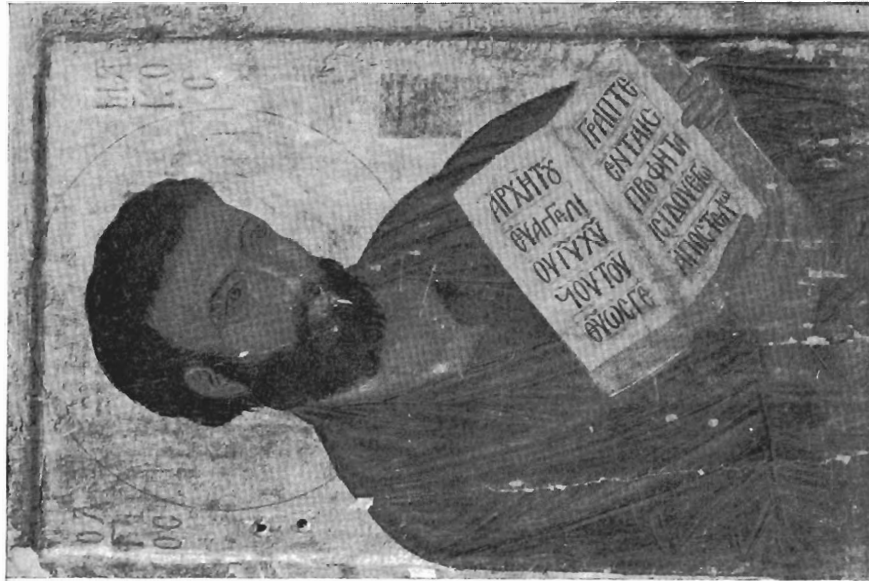
A. — St. Mark.