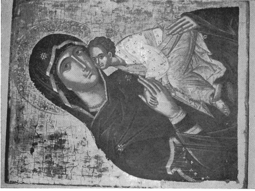
B. — Panagia Eleusa of Sibenik.