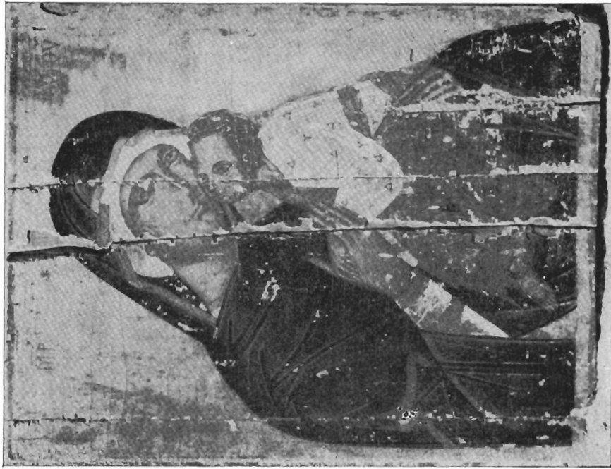
A. — Panagia Eleusa of the Monastery of St. Macarius.