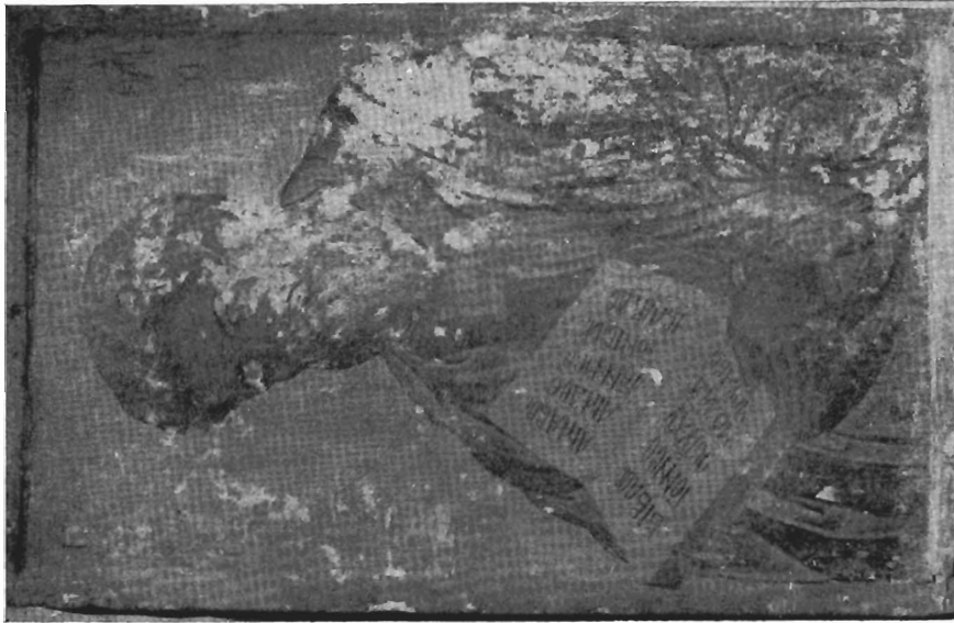
B. — St. Matthew.