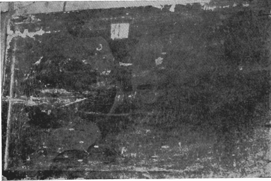
B. — An Archangel.