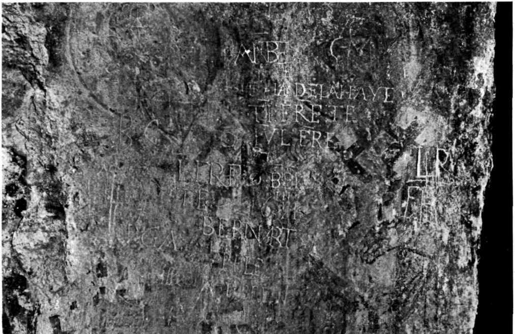
b. XVIIth cent. graffiti. Church of St. Solomoni, Paphos, Cyprus.