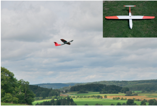
Fig. 1. Start of the unmanned aerial vehicle Carolo P200. Initially, the UAV gets manually started. Once it has reached the desired height, it can fly automatically along any predefined spline-based trajectory.