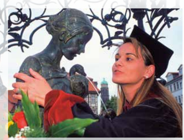
One of the nicest traditions in Göttingen: Kissing the Gänseliesel without falling into the water basin is the "final hurdle" before receiving the PhD degree. This makes the Gänseliesel the most-kissed girl of the world.