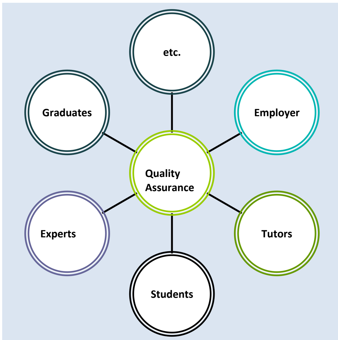
Diagram 1: Multidimensional Perspectives in Quality Assurance for Teaching and Learning

For Quality Assurance of teaching and learning it is important that different points of view are taken into account in this: