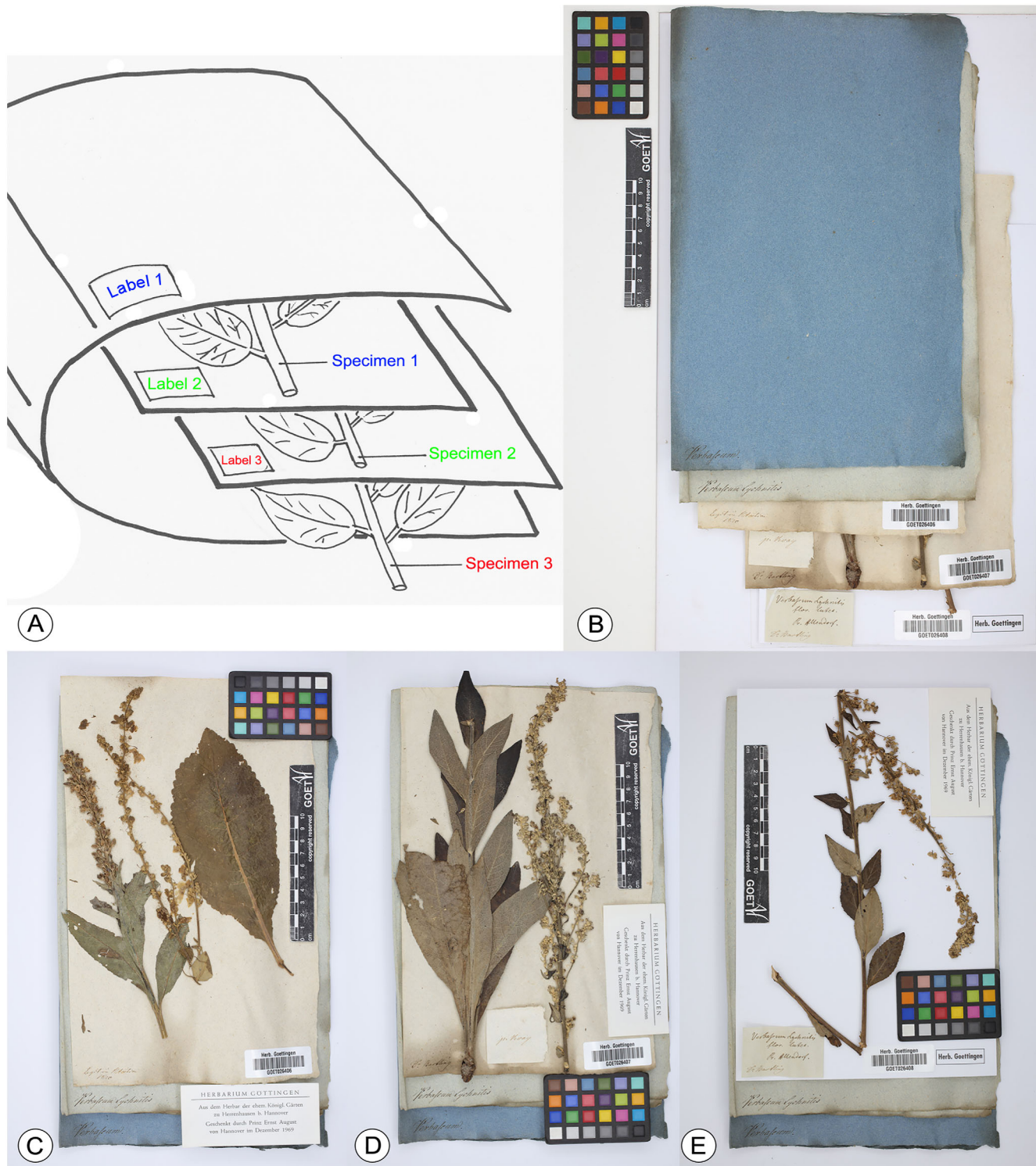
Fig. 1. An example of a species folder with more than one specimen in the Herrenhausen Herbarium ordered according to the Linnaean System. A , Pictogram showing the relation of label information with the specimens included in the folder; B , Blue genus folder “ Verbascum ” with the species folder “ Verbascum lychnitis ” and three collections included in it. For the digitization ( C–E ), specimens were positioned over the genus and species folders, in a way so that the information on these folders was visible. C , GOET026406: “ Verbascum ” (genus folder), “ Verbascum lychnitis ” (species folder), “Legit in Helvetia 1820” (written on sheet, bottom left); D , GOET026407: “ Verbascum ” (genus folder), “ Verbascum lychnitis ” (species folder), “Dr. Bartling” (written on sheet, bottom left), “p. Vevay” (written on loose label); E , GOET026408: “ Verbascum ” (genus folder), “ Verbascum lychnitis ” (species folder), “ Verbascum Lychnitis flor. lutea pr. Allendorf Dr. Bartling” (written on loose label). Collection data for the specimens are: GOET026406: no locality and collector on sheet; GOET026407: Legit in Helvetia 1820, prope Vevay, HLW; GOET026408: prope Allendorf, Bartling.