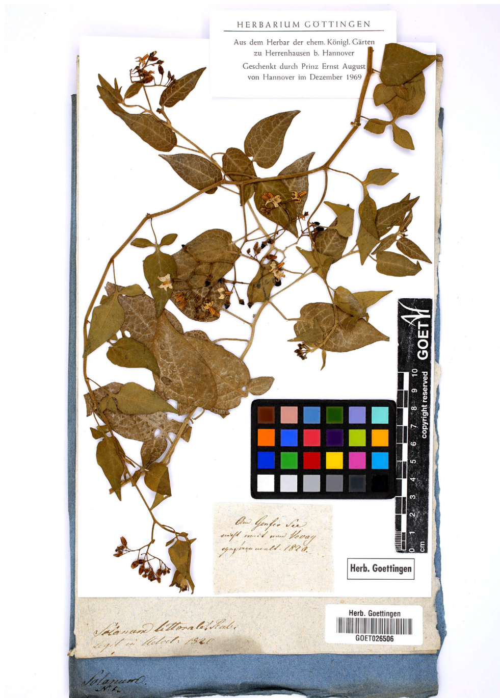
Fig. 6. Specimen collected by Heinrich Ludolph Wendland in Switzerland. Solanum littorale Raab (synonym of Solanum dulcamara L.) near Vevey, Lac Léman (= Lake Geneva), 23 July 1820; GOET026506.

According to Wagenitz (2016) there is no indication of collectors or dates in the herbarium “Flora alpina du Lac des