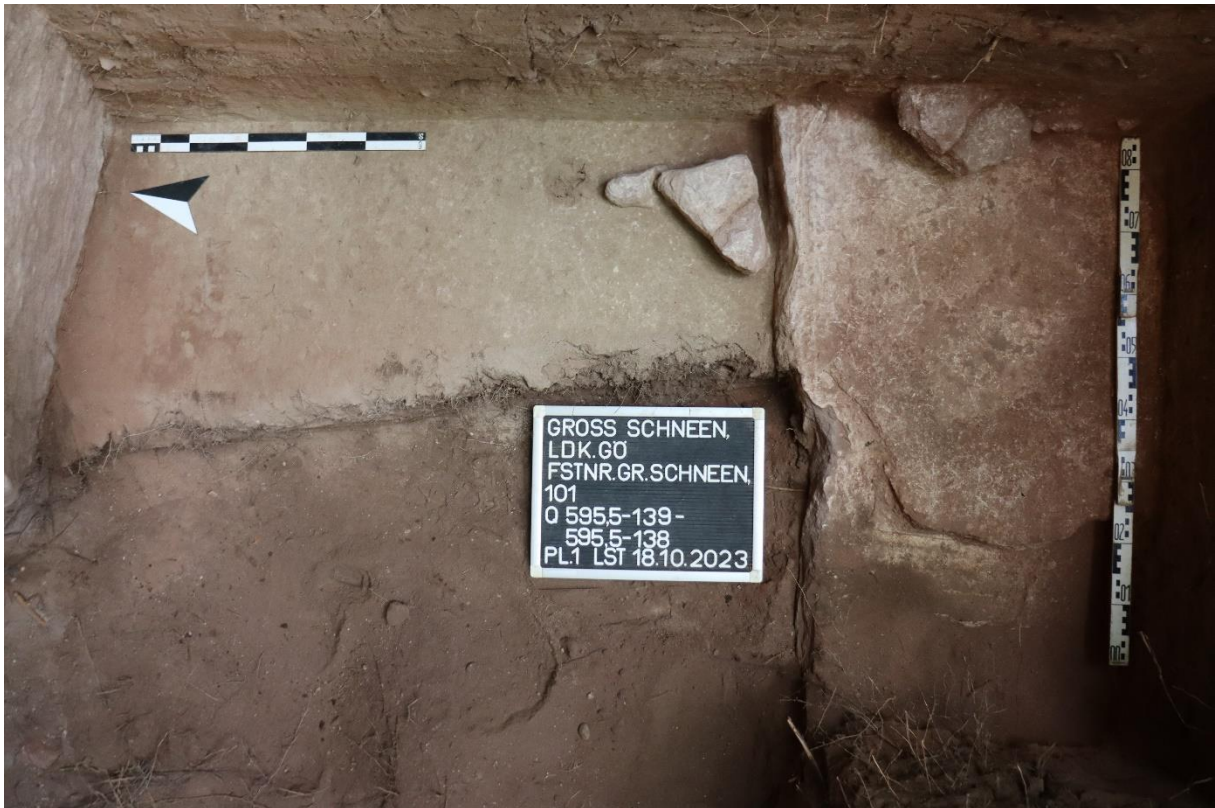
Fig. 5: The upper planum of the LST-layer. The grey sediment is the Laacher See Tephra.