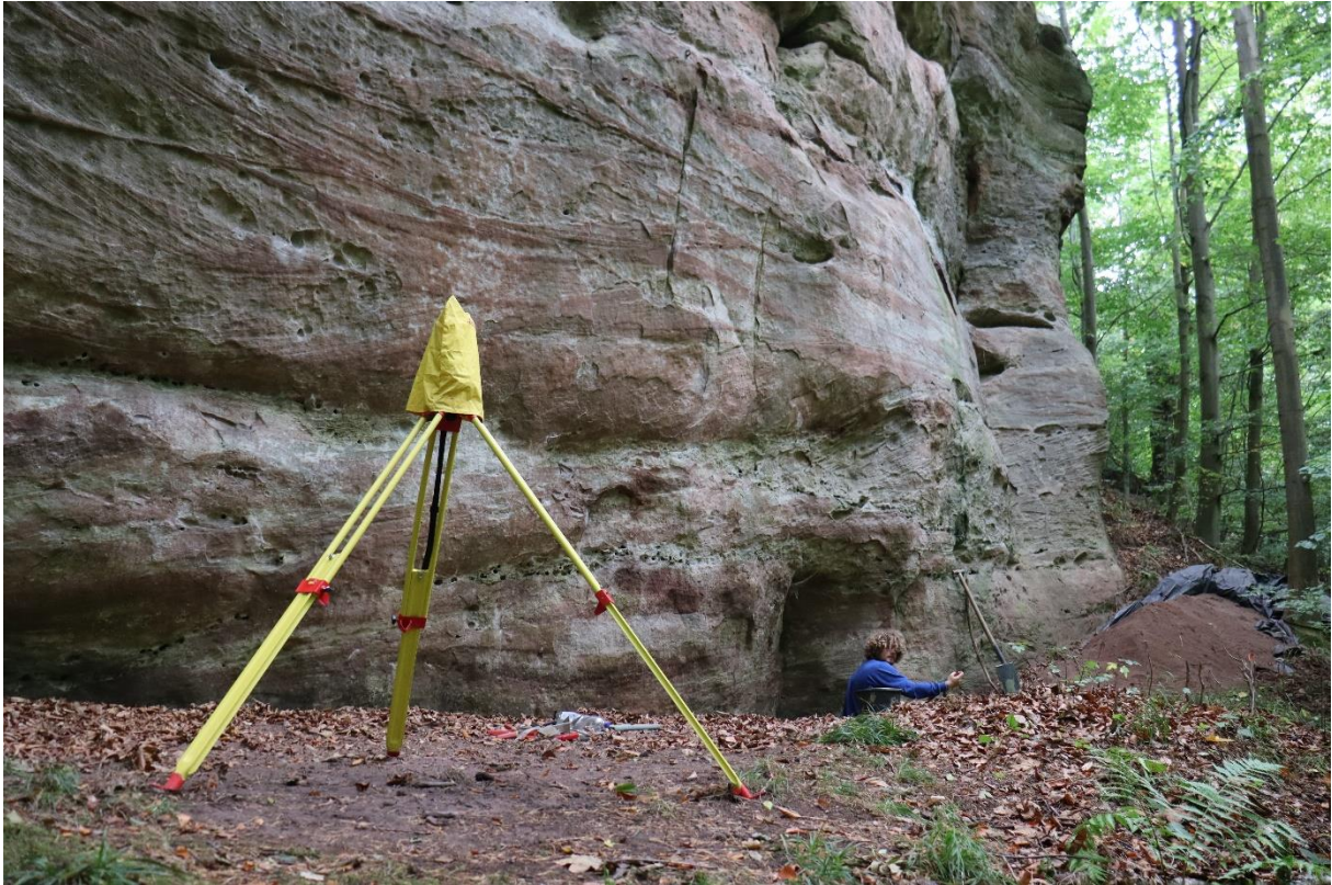
Fig. 2: The rock face of the Abri Stendel XVIII. In the background: the re-opening of the trench from 1989.