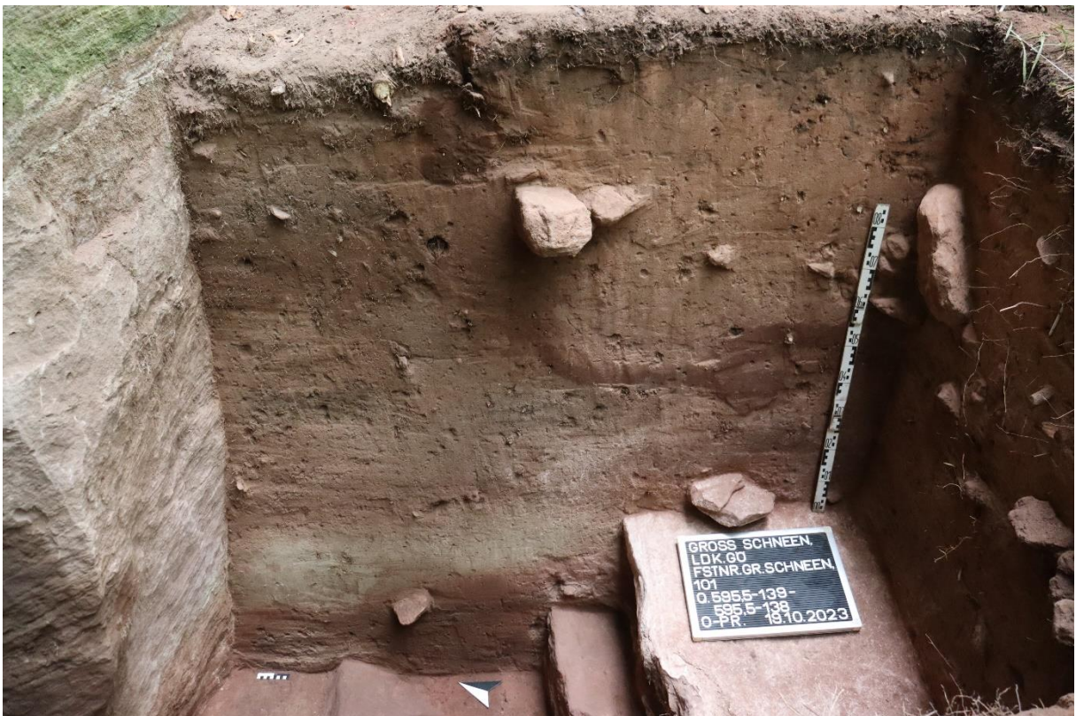
Fig. 4: The E-profile at the foot of the Abri Stendel XVIII. The Laacher See Thephra is the white layer in the bottom left corner.