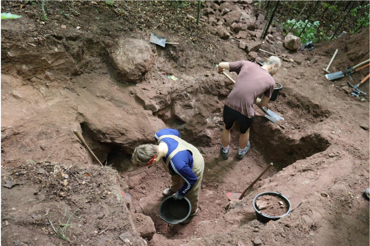
Fig. 3: The re-opening of the excavator trench from 1997 at the slope underneath the Abri Stendel XVIII.