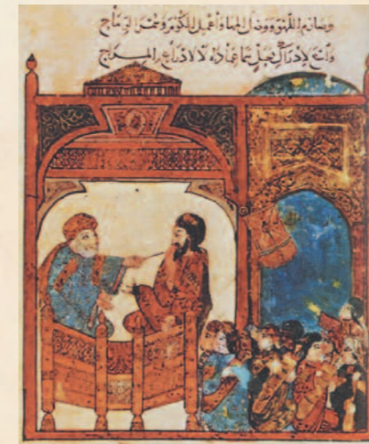
Teaching Session. From Hariri's Maqamat, Ms. ar. 5847, fol. 18v (BNF Paris). Quoted from Children and Youth in History, Nr. 243, http://chnm.gmu.edu/cyh/primary-sources/243 (19.8.2011).